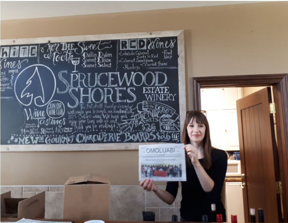
Sprucewood Shore Estate Winery

you think that telling people that you will begin to respect them will make them respect you right away? NO! These people will wait to see you putting your own words into execution, they will wait to see you respect even those who hate you. Finally, respect can be defined in one word, politeness. If you think to respect others but not to be polite, it means that you are not respectful. I encourage everyone to respect each other because it is the key to a solid union.