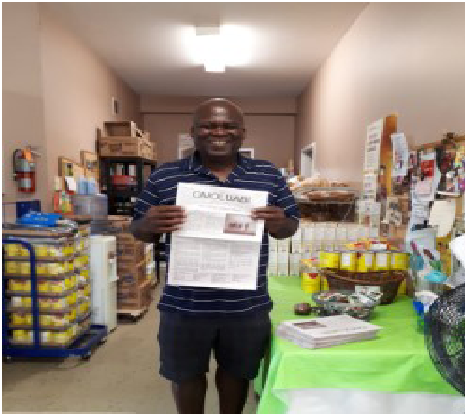
Amherstburg Food & Fellowship Mission