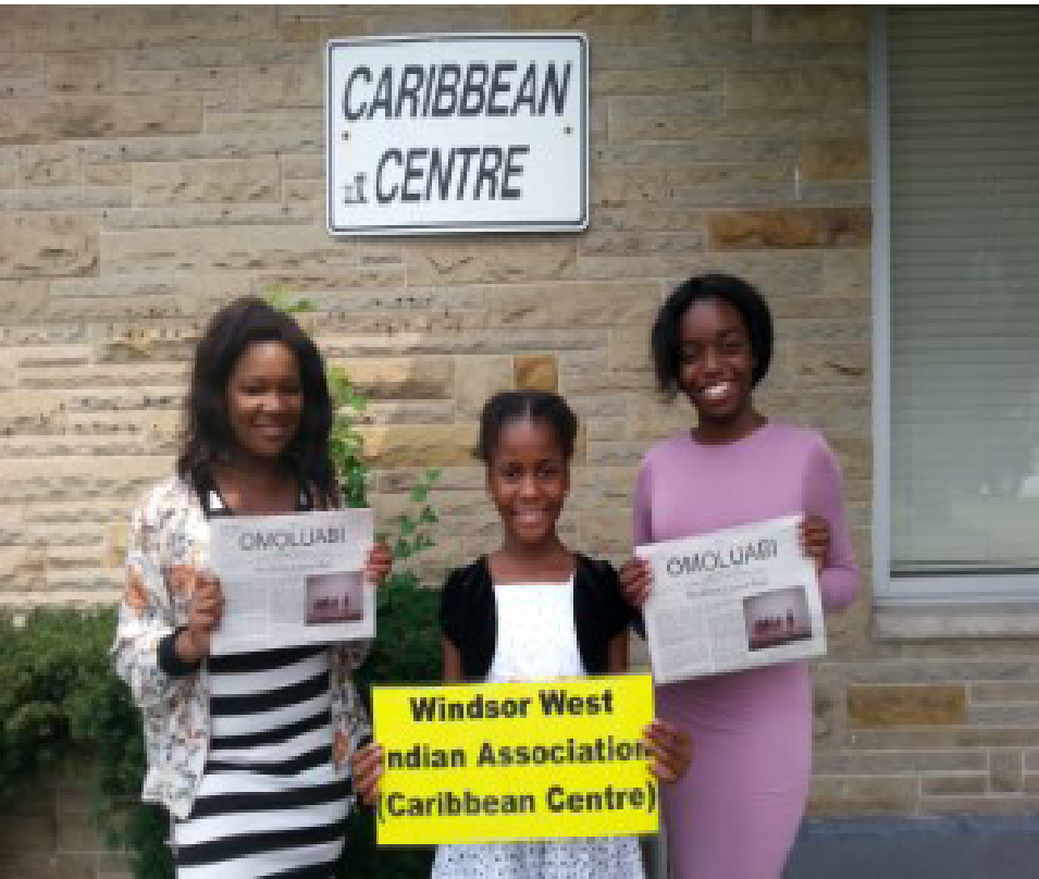
Windsor West Indian Association Youth

For more detailed locations of newspaper pickup locations, please contact us at our main office: # 519-966-2767 or email us at info@omoluabi.ca