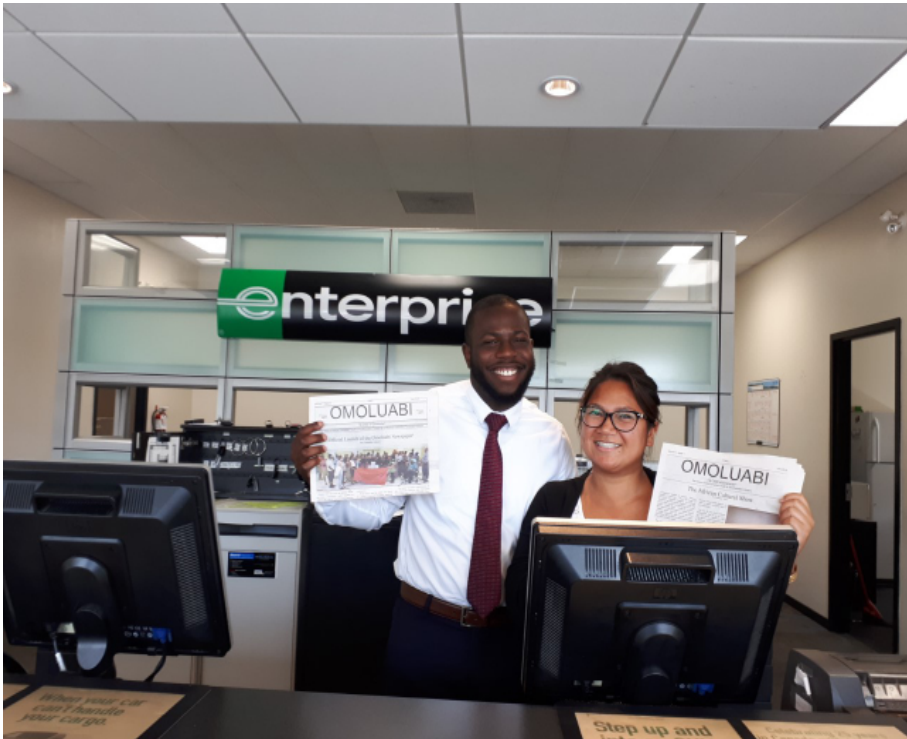
Enterprise Tecumseh Location

For more detailed locations of newspaper pickup locations, please contact us at our main office: # 519-966-2767 or email us at info@omoluabi.ca